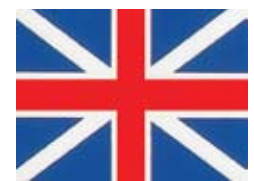
UNION JACK / KING'S COLORS

Kings Colors... one of the military colors used by British colonial troops after 1743. As the British Union Flag it was the standard raised by the James-town settlers in 1607. The design originated from the combination of St. George Cross with the Scottish Cross of St. Andrew.