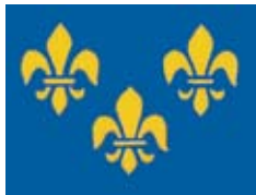
FRENCH FLEUR DE LIS

French Fleur-de-lis is believed to have been introduced by Jacques Cartier to North America as early as 1534. Several famous French explorers such as Champlain and La Salle carried it.