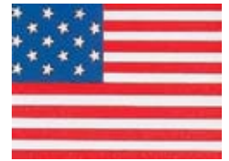
STAR SPANGLED BANNER

flag was created shortly before the war of 1812. This flag flying over Fort McHenry during a British naval bombardment, inspired Francis Scott Key to Compose our National Anthem.