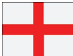
ST. GEORGE'S CROSS

St. George Cross... the flag carried to the New World by most of the early English explorers. Its use can be traced back to 1277 in Britain.