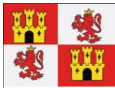
ROYAL STANDARD OF SPAIN

Royal Standard Of Spain... This flag also known as the Lions and Castles Flag accompanied Christopher Columbus on his voyage to the new world. Spanish explorers who followed Columbus spread it throughout Spain's new colonies.