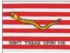
FIRST NAVY JACK

is believed to have flown aboard the Continental Fleet's flagship Alfred, in January 1776. Commodore Esek Hopkins raised this flag to signal his fleet to attack the enemy.